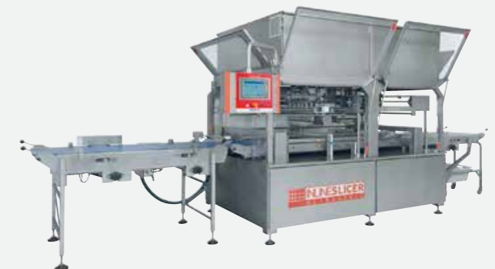
Multi station INLINE ULTRASONIC SLICER with extra high production capacity