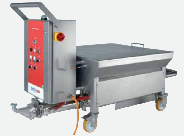
D Movable and heated container. Available in 50 or 120 liter and with or without stirrer.