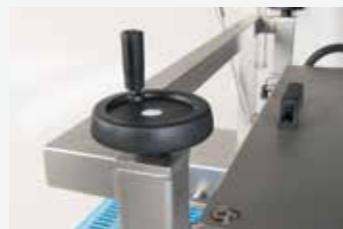
B Adjustable scrapers