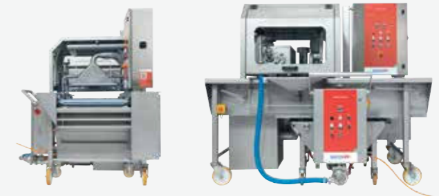
D Melting tank

The melting kettle can be placed next to the ENROBER for the automatic filling of the machine. This can be done in less than no time and while the machine is in use. A level control ensures that the content of the Melting Tank does not fall below a certain level.